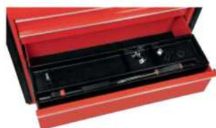
KA31X36 (tools and accessories not included)