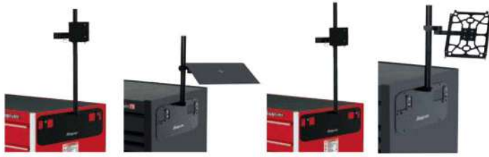
KAMHEXT/ KAMHKB KAMHLAP/ KAMH2024A KAMHMP KAMHTBLT