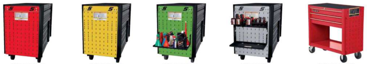
KA2637PBO KA2637PES KA2637PJJ KA2637SS KA1734APBO