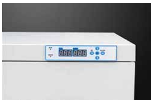
Digital Display & Control Panel