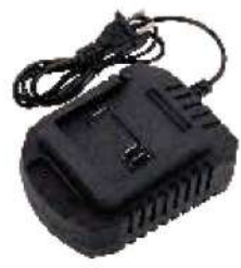
51521 Lithium Charger 18V