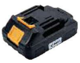
51520 18V Lithium Battery 2.0A