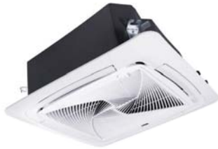
(Applicable to 19,030-50,000 Btu/hr)