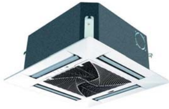
(Applicable to 10,000-13,800 Btu/hr)