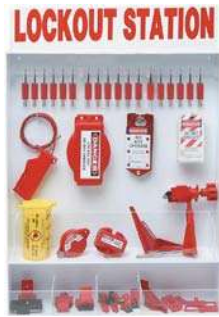
Shown without optional lockable clear acrylic door