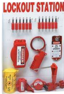
Shown without optional lockable clear acrylic door