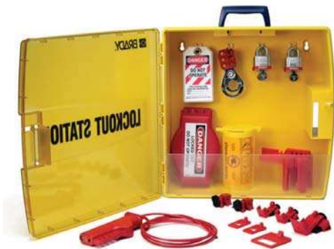
Pictured: Ready Access Valve & Electrical Lockout Station