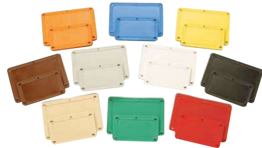
Choose from 10 different colors!