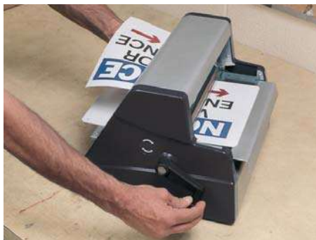
Laminates documents up to 12" wide