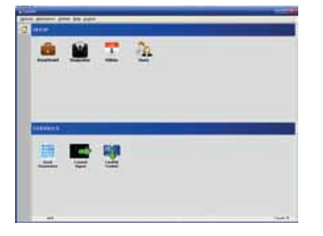
Intelligent Graphical User Interface