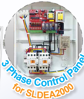
3 Phase Control Panel for SLDEA2000

DEA was founded in the early 90's with the aim of producing technologically advanced automations that distinguished themselves for outstanding quality and mechanical reliability. MAG electronic control system is manufactured with the best components and 20 years time proven design. Combing DEA mechanical with MAG rock solid electronic control system will give you a product that is safe, superior technology, reliable quality and yet very much affordable.