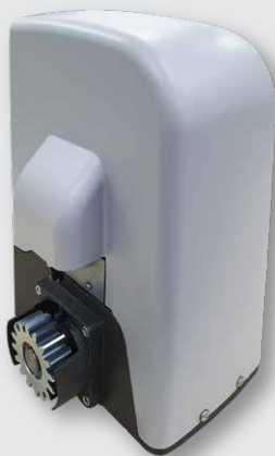
LIVI Lite series 400 / 900 kg