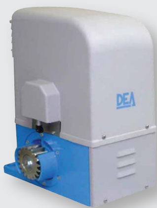
GULLIVER Heavy series 1500 / 2000 kg

Reliable at the time you need it the most