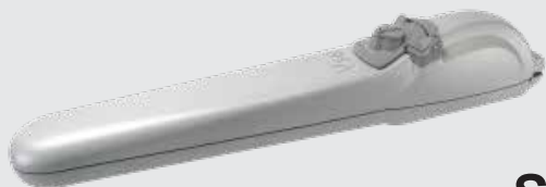
WING Sting Series