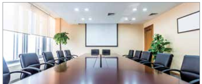
Auditorium, seminar/meeting rooms