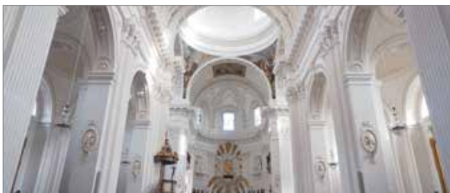
Houses of Worship