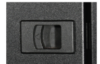
Side Panel Latch