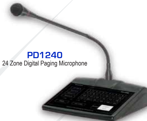
PD1240 24 Zone Digital Paging Microphone