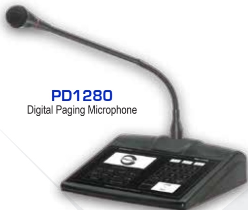
PD1280 Digital Paging Microphone

PD1240 is a 24 buttons zone control with 4 fixed groups with ALL CALL, suitable for small setup. For larger installations of up to 254 zones, PD1280 shall fit into the requirement which comes with large LCD panel and programmable 9 priority levels.