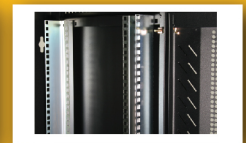
19" Panel Mounting