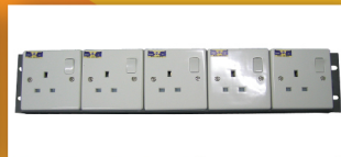
19" 5 Gang Power Distribution