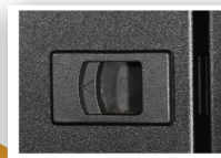
Side Panel Latch