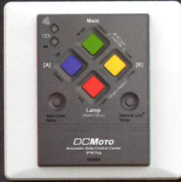
Wireless Multi Function Keypad With Anti-Spy Technology