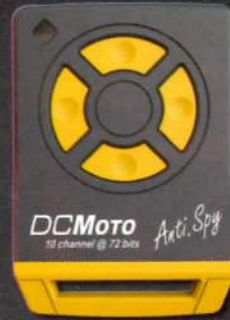
Multi Function Remote Control