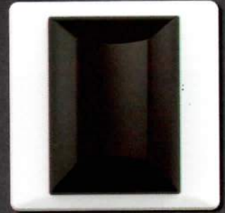
Infrared Safety Beam (Optional)