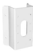
DS-1476ZJ-Y Corner Mount