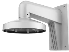
DS-1473ZJ-155-Y Wall Mount