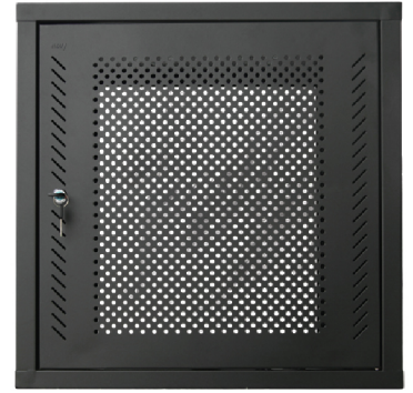
FULL PERFORATED DOOR