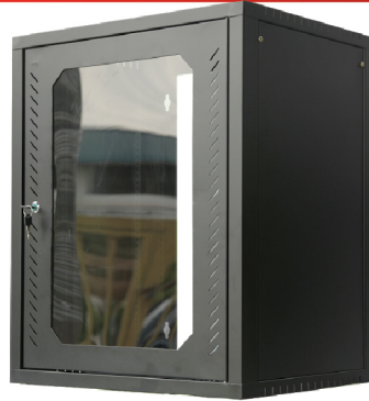
PERSPEX WITH FRAME DOOR