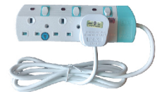
3 Gang Power Distribution