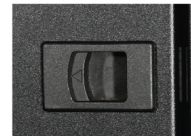
Side Panel Latch