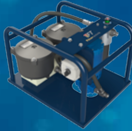
Twin Hippo Filter with SRLT option - BD5000