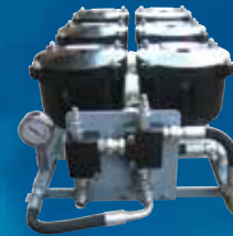
6 Hippo Configuration FTP-180-6