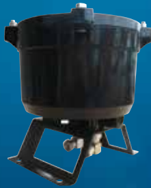
Hippo Filter - FTP 180

The BD5000 is one of many Hippo Filtration solutions. The Hippo is available on its own, as a four, six or eight configuration along with your choice of elements.