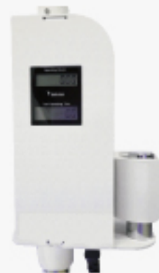
Time Counter & Clamp