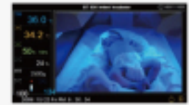
SpO2 & Camera