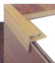
Stair Nose (F)