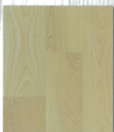
D-1551 REGAL MAPLE