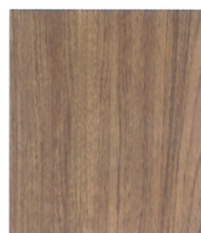
D-9021 NOCKSTEIN WALNUT