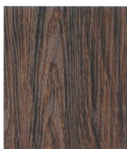
U-1609 DARK WALNUT