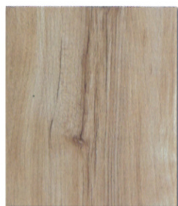
U-8045 SNOW OAK