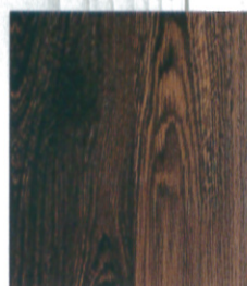
D-1726 ANDES PANGA