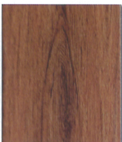
U-7021 LUSIO PINE