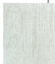
D-2213 WHITE OAK