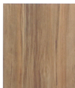
U-1673 LIGHT HICKORY