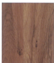
D-2106 MEERSBURG ROSEWOOD