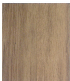
D-2682 COUNTRY OAK