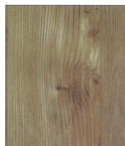
U-8610 VALENCIA PINE