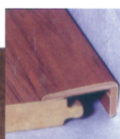
END Border L