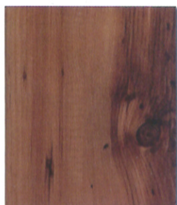
U-4137 MONTANA PINE