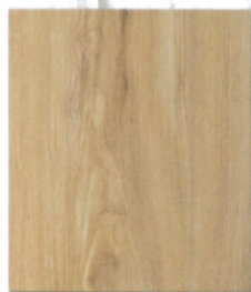
D-1660 CASTILLO SPRUCE

Dynaloc Flooring offers great looks at affordable price. It's also durable and easy to maintain. The natural beauty of flooring can bring warmth and character to any room and suit any decor.