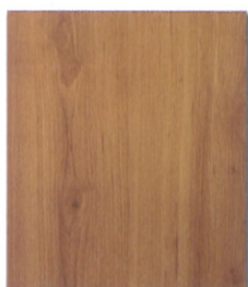
D-6026 NAPOLI ALDER