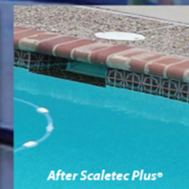
After Scaletec Plus®

Images of white calcium removal on tile - without acid and scrubbing Actual untouched photos - San Antonio, TX