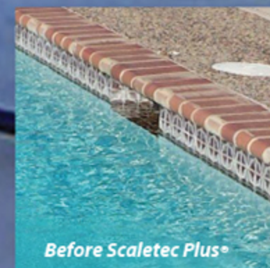
Before Scaletec Plus®

For a copy of the above Easy-Wash procedures, visit EasyCare Products website www.easycarewater.com and select Scaletec Plus product page to locate "Scaletec Plus Easy-Wash" document.