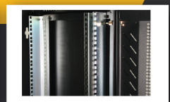
19" Panel Mounting