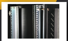
19" Panel Mounting