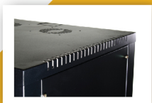
Top Cover Vented Design