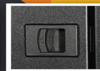
Side Panel Latch