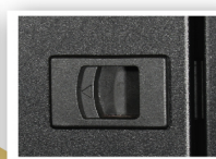
Side Panel Latch