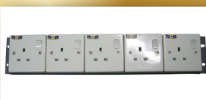
19" 5 Gang Power Distribution