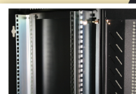
19" Panel Mounting