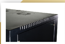
Top Cover Vented Design