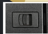
Side Panel Latch