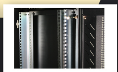
19" Panel Mounting