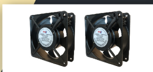
Ball Bearing Fans