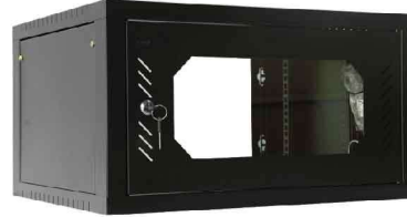
PERSPEX WITH FRAME DOOR