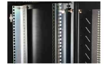
19" Panel Mounting