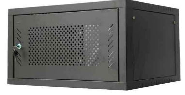
FULL PERFORATED DOOR