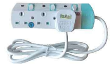
3 Gang Power Distribution