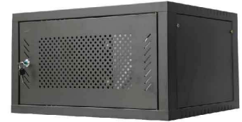
FULL PERFORATED DOOR