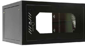
PERSPEX WITH FRAME DOOR