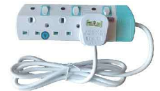
3 Gang Power Distribution