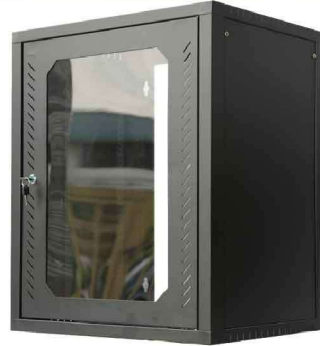
PERSPEX WITH FRAME DOOR