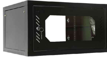
PERSPEX WITH FRAME DOOR