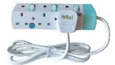
3 Gang Power Distribution