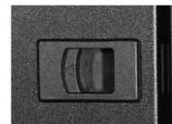
Side Panel Latch