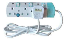
3 Gang Power Distribution