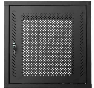
FULL PERFORATED DOOR