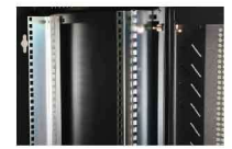
19" Panel Mounting