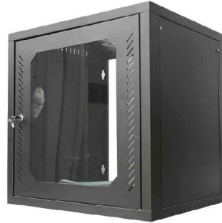
PERSPEX WITH FRAME DOOR