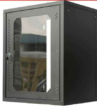
PERSPEX WITH FRAME DOOR