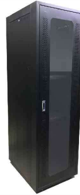
FRONT TEMPERED GLASS DOOR