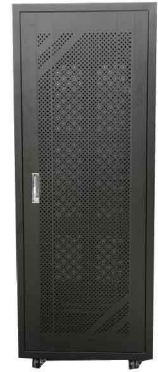
FULL PERFORATED DOOR