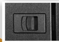
Side Panel Latch