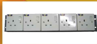
19" 5 Gang Power Distribution