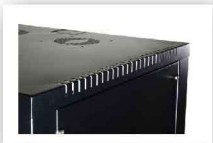
Top Cover Vented Design