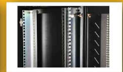
19" Panel Mounting