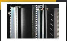
19" Panel Mounting