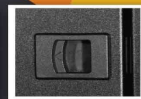
Side Panel Latch