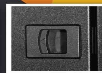
Side Panel Latch