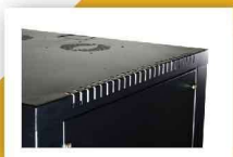
Top Cover Vented Design