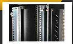
19" Panel Mounting