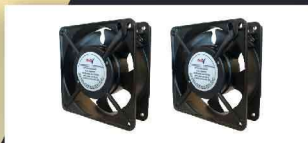
Ball Bearing Fans