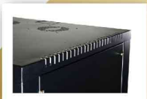
Top Cover Vented Design