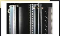
19" Panel Mounting