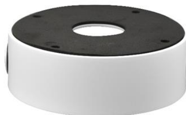
JB69 Junction Box