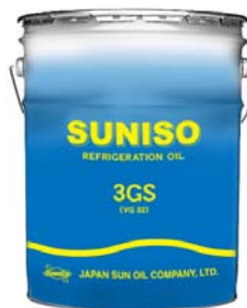
20 Liter Pail