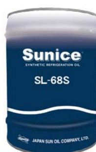
20 Liters Pail