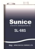
4L Tin Can