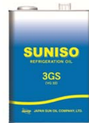
4L Tin Can

New design of “SUNISO GS” is applied for 20 Liter Pail and 4 Liter Tin Can.