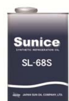
1L Tin Can

New brand name and design of “SUNICE SL-S” is applied for 20 Liter Pail, 4 Liter Tin Can and 1 Liter Tin Can.