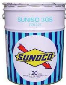
20 Liter Pail