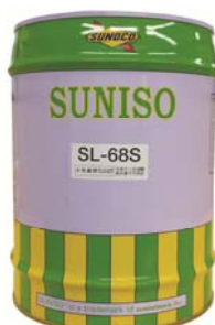
20 Liter Pail