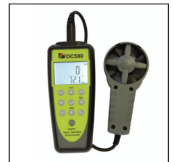
DC580 with vane probe