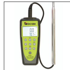
DC580 with hot-wire probe