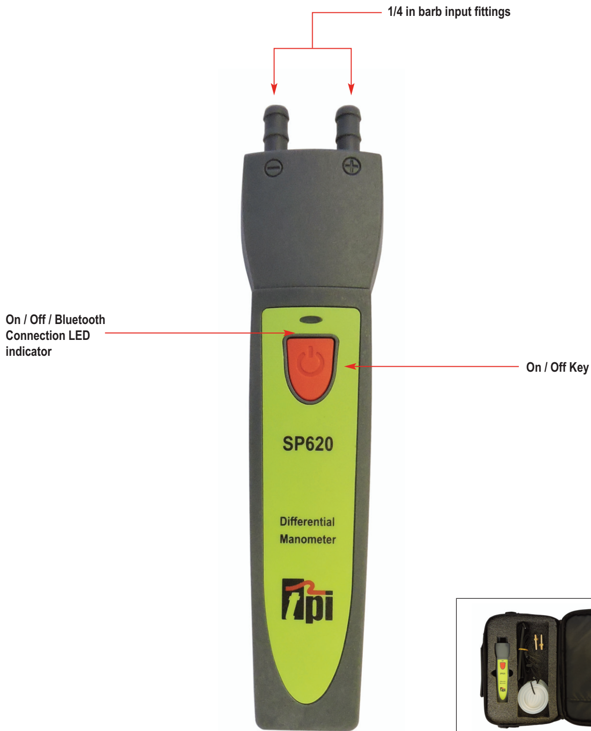
SP620 Photo Actual Size

L x W x D 6.7" x 1.5" x 0.75" 169mm x 39mm x 19mm