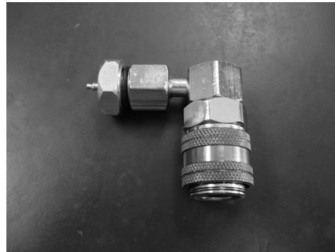
Coupler with Filter

Neutronics to insert photo of unit upon receiving Mastercool labels.