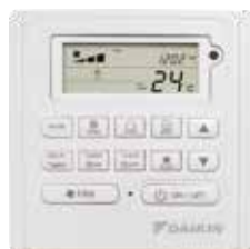
Single Condenser system (three fan speed controller)