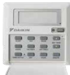
Multi Condenser System