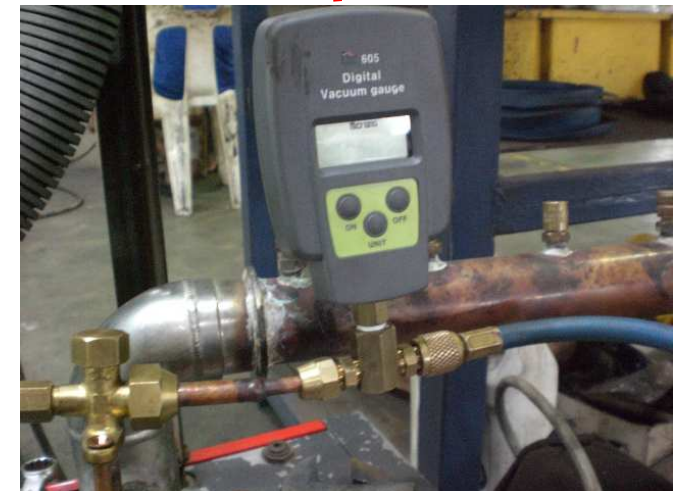
TPI605 Digital Vacuum Gauge Installation