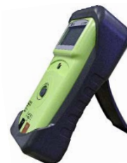
EZ 100 shown with standard A101 tilt stand protective boot

EZ 100 Comes Complete With: (2) A002 1.5V Battery, A040 Test Lead Set, A101 Rubber Boot