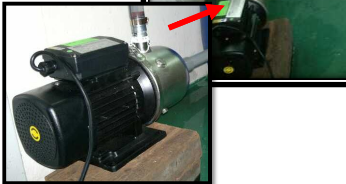
WEBSTER WBP2-30 (1/2HP) Centrifugal Pump