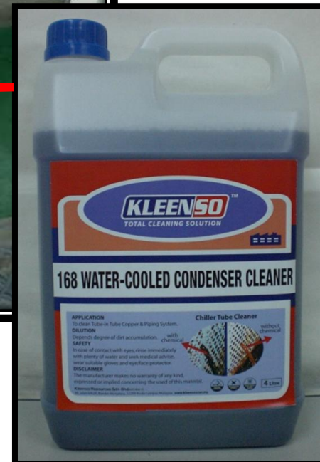
Kleenso 168 Water-Cooled Condenser Cleaner