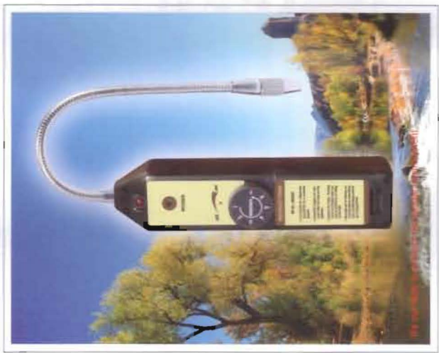
WJL-6000 HALOGEN LEAK DETECTOR