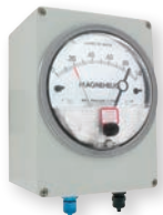
A-320-A With Gage Installed