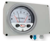
A-320-B With Gage Installed

SERIES A-320 Instrument Enclosure protects instruments in all applications. The A-320-A fits standard Magnehelic® size instruments (4-9/16" diameter) and the A-320-B fits standard 3000MR Photohelic® switch/gage size instruments (4-13/16" diameter). Both models include silicone tubing, gage bars and mounting hardware.