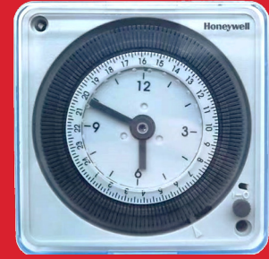
List No: T5808

Compliant to EN 60730-2-7, analogue timer are designed with high precision & exactness of time.