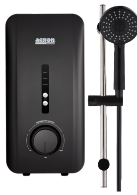
● Model ASH38A-B Colour Black