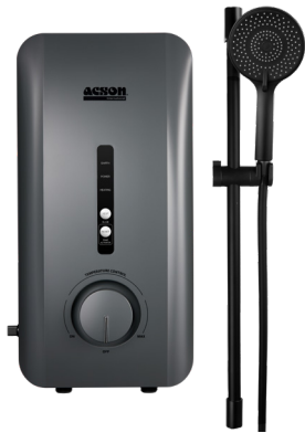
● Model ASH38AP-G Colour Grey