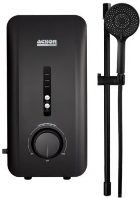
● Model ASH38AP-B Colour Black