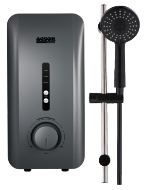
● Model ASH38A-G Colour Grey