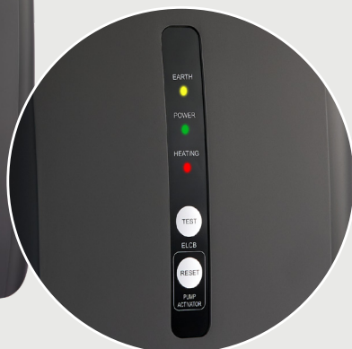
ELCB sensitivity 15mA