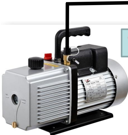
Culmi Vacuum Pump